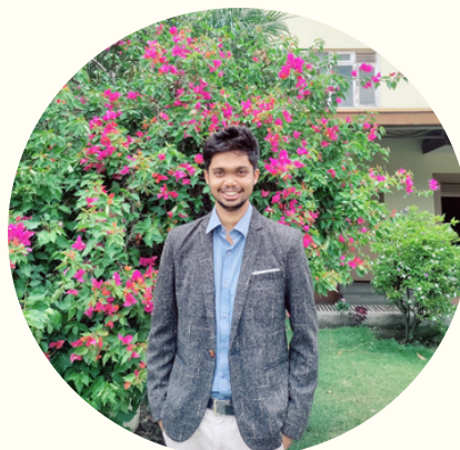
DESIGNED BY Rtr. Subodh Acharya